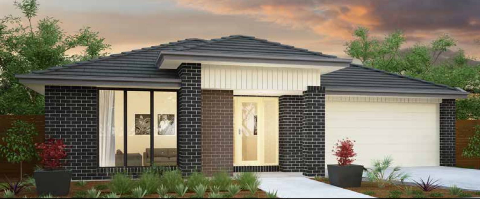
image for illustrative purposes only