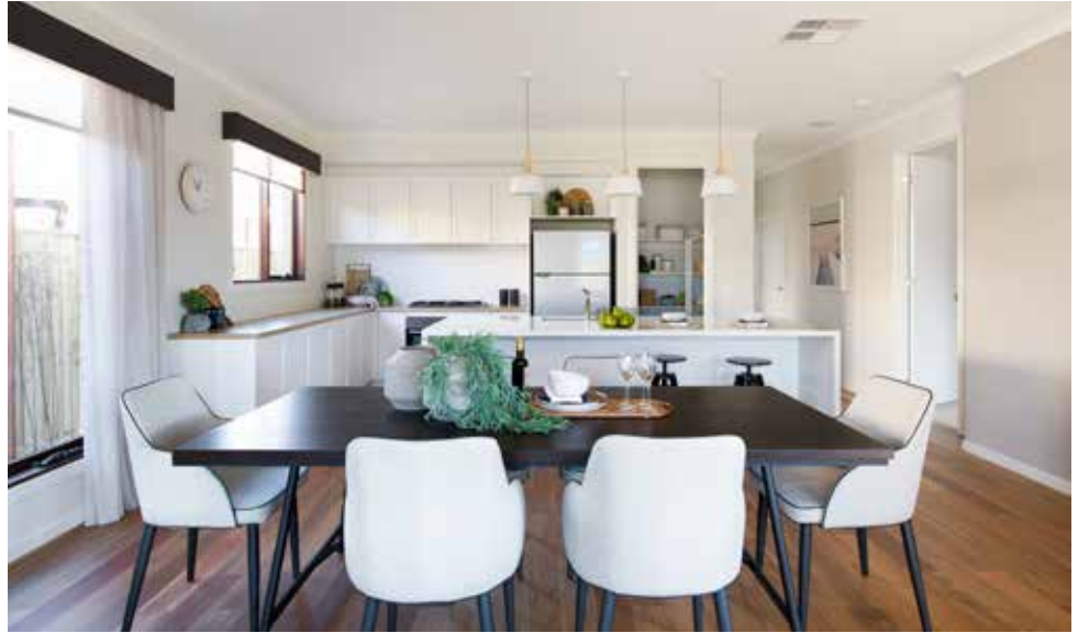
Photo is for illustrative purposes only and does not depict the home for sale. This image contains internal or external luxury upgrade items and furniture not included in the home price.